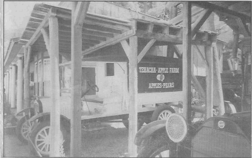
Look Closely at the sign on the side of the car..

Inevitably, trouble would find one or all of them. But the 500 million viewers who tuned in each week for fourteen full seasons (430 episodes) weren't worried; they knew the Cartwrights would persevere because they were a family who stuck